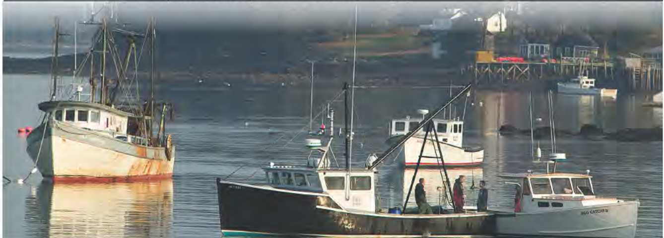
Figure 1. Elements of the Working Waterfronts Toolkit